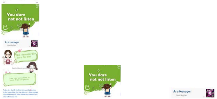
Fig. 14 Design interface Fig. 15 Slice picture 1 Fig. 16 Audio file