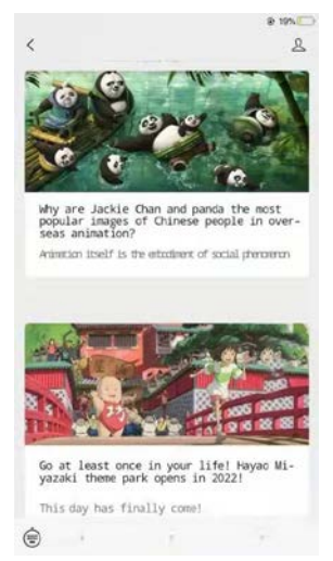
Fig. 9 Cover of cultural communication public account

2. Clearness and conciseness. Since the size of the tweet cover of the public platform is 900*383px, we should try our best to make the cover picture concise and clear in such a limited space. Do not use solid color or large white color. The design of the following two illustrations proves the contrary. The first cover in the design of Fig. 10 has complicated and disorderly text content, and the background picture also has very complicated graphics and color block elements, which together will inevitably make people feel dazzled and unable to find the key point. The cover graphic in Fig. 11 is too pale to be missed out on.