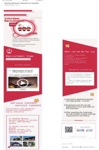
Fig. 13 Reasonable human-computer interaction design