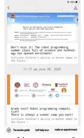
Fig. 11 The graphics are too pale on the cover