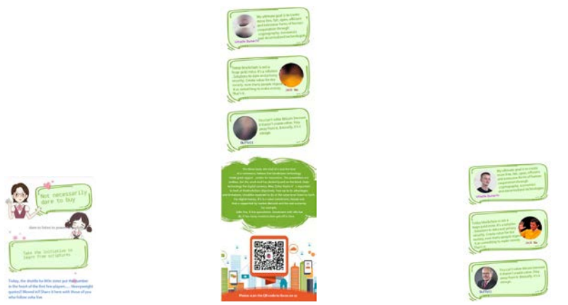
Fig. 17 Slice picture 2 Fig. 18 Interactive function picture Fig. 19 Link page

Although third-party editing software templates are simple and easy to use, the number is limited, and excessive use will result in poor performance. Therefore, skillfully combining image processing or audio and video processing software to flexibly realize each characteristic creative design in the information graphic design area of WeChat platform is a necessary skill for a professional interface designer.