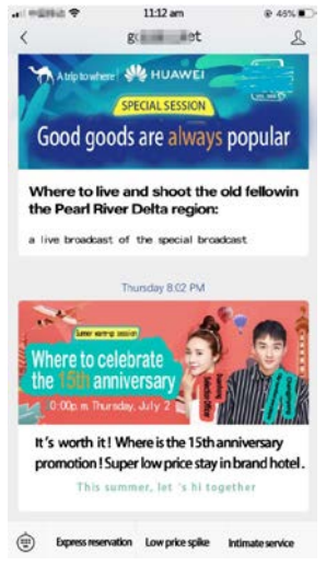
Fig. 8 As the cover of the public account for commercial promotion

1. Keeping to the point. As the cover picture is an important reading power and visual element for users to browse WeChat official account, its design must be closely related to the theme, so that people can know about the cover picture at first glance and arouse the interest of clicking, which can be technically realized by creative graphics and colors, and the processing of title words and cover graphics should complement each other with distinct levels. Fig. 8, as the cover of WeChat official account in the business promotion category, highlights the key points and themes by using relatively pure pictures, words and bright colors. Fig. 9, as the cover picture design of WeChat official account for cultural communication, complements the theme and content, with exquisite and clear design with text, which well resonates with the viewers.