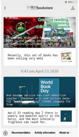
Fig. 10 The first cover text is complicated and messy

2. Clearness and conciseness. Since the size of the tweet cover of the public platform is 900*383px, we should try our best to make the cover picture concise and clear in such a limited space. Do not use solid color or large white color. The design of the following two illustrations proves the contrary. The first cover in the design of Fig. 10 has complicated and disorderly text content, and the background picture also has very complicated graphics and color block elements, which together will inevitably make people feel dazzled and unable to find the key point. The cover graphic in Fig. 11 is too pale to be missed out on.